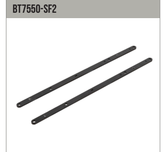
Interface Adapter Arms for Samsung® Flip 2™