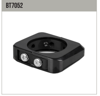
Ø50mm Accessory Collar Designed to attach a variety of different mounts and accessories onto B-Tech poles