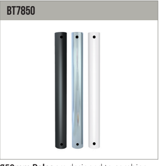
\emptyset 50mm Poles are designed to combine with B-Tech floor bases or ceiling mounts. Available in Black, Chrome or White.