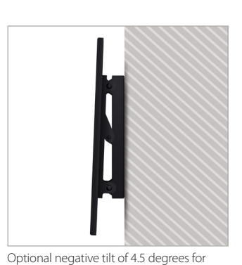
easier use of touchscreens (ideal for Samsung Flip)