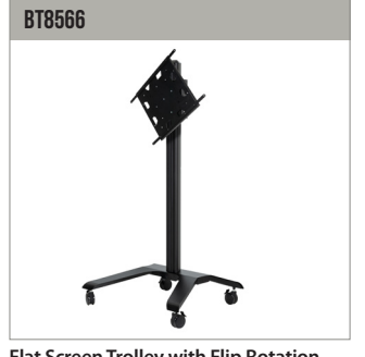
Flat Screen Trolley with Flip Rotation for screens up to 70"