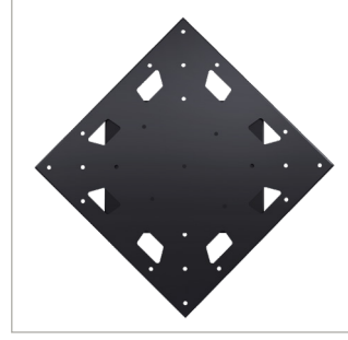
Angle guides help set the desired rotation of your screen