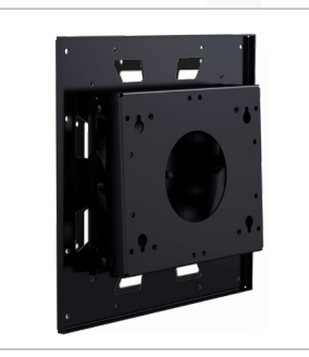
Can be used as a stand alone wall mount or attached to a suitable screen mount